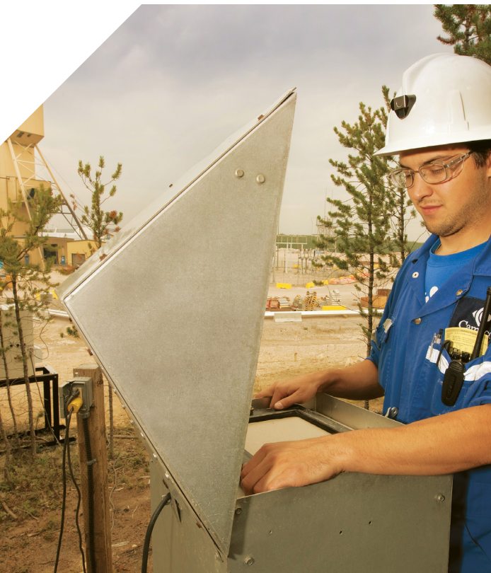
Cigar Lake's environmental monitoring program confirms the operation's environmental performance is meeting all regulatory criteria.