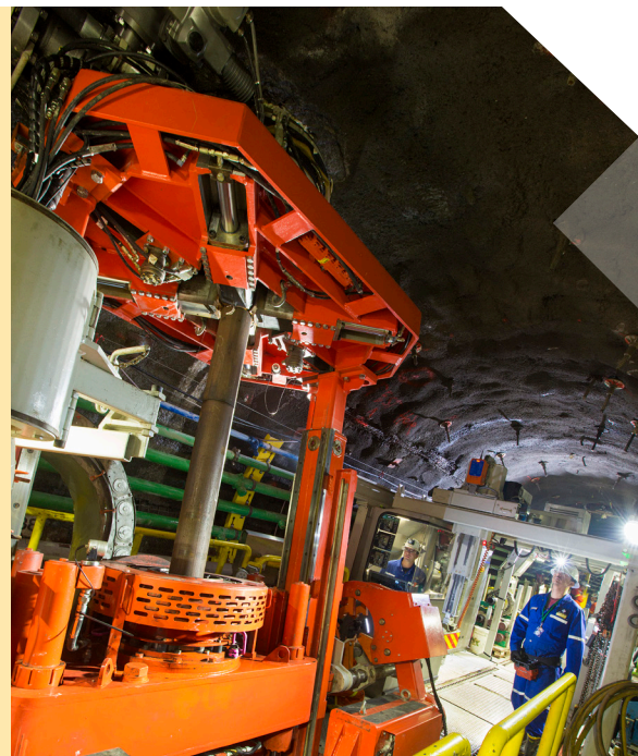
Jet boring is a non-entry mining method that allows frozen ore to be mined from a production tunnel located about 30 to 40 metres beneath the orebody.