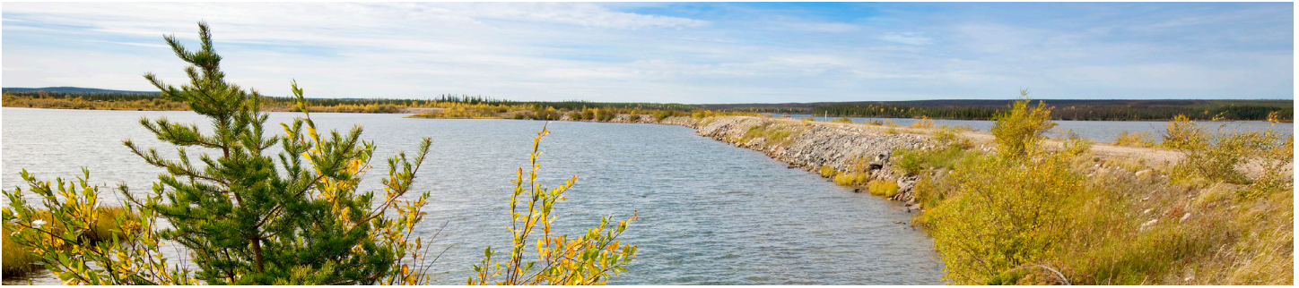
Reclamation activities have continued as part of Rabbit Lake operation's care and maintenance program.