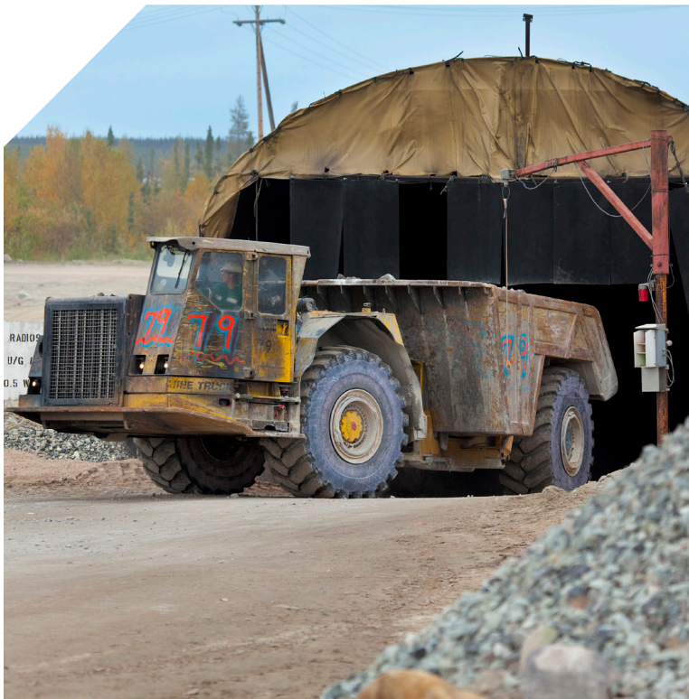
Eagle Point mine has been secured to ensure stability of mined-out areas of inferred resources and to ensure minewater can continue to be collected and pumped to surface for treatment during the care and maintenance period.

Historically, ore has come from four open pits and one underground mine at the site. All ore mined on the site was processed to uranium concentrate (yellowcake) at the Rabbit Lake mill. All ore in recent years came from the Eagle Point underground mine.