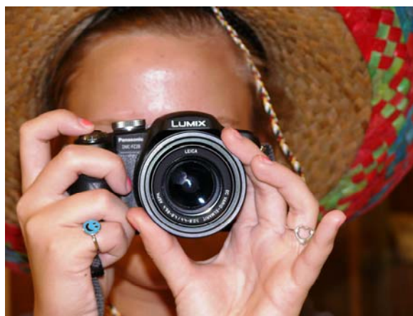
A picture taken by a student with a new digital camera of a student taking a picture with a new digital camera.

Funds were used to purchase digital cameras for the photography and the yearbook publication classes.