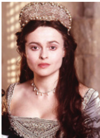
Helena Bonham Carter