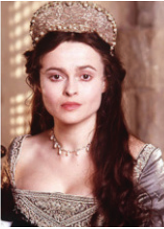
Helena Bonham Carter