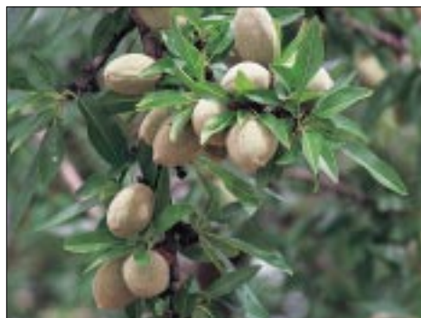
Almond production requires substantial amounts of K, and deficiency can reduce future yield potential.