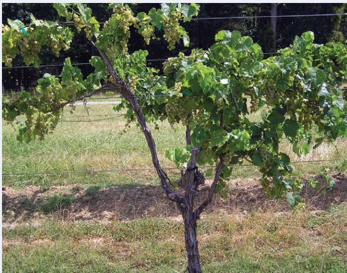
Decline of vine size and less dense canopy on a severely affected Vidal Blanc vine.

GVCV spreads primarily through propagation of infected cuttings and buds. Grafting transmits GVCV quickly. Severe symptoms showed up on the grafted Chardonnay within three months after grafting. It is possible that the virus may also be spread by an insect vector. Disease incidence has been observed to increase over time. No insect vectors have been identified.