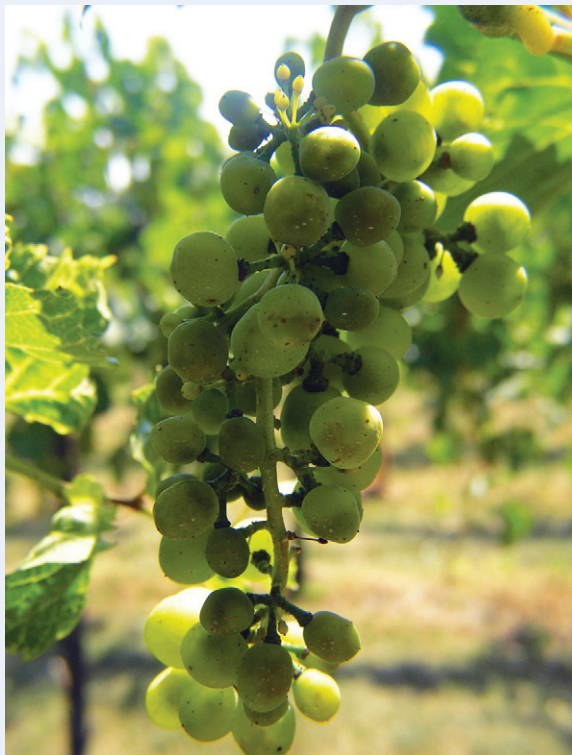
Reduced cluster size and deformed berry shape on a severely affected Vidal Blanc vine.