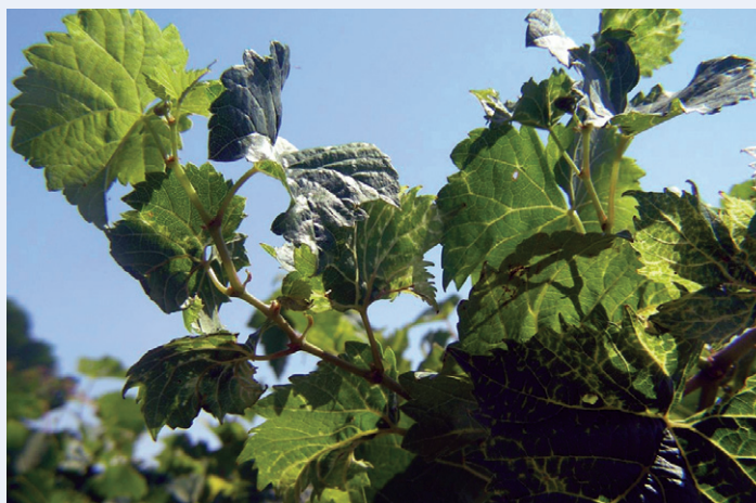
Short, zig-zag internodes on shoots.