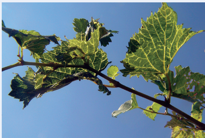
Translucent vein clearing on young leaves. Photo: Wenping Qiu, Missouri State University.

Grapevine vein clearing virus (GVCV) is a new DNA virus, the first DNA virus discovered in grapevine (most grapevine viruses are RNA viruses). It is a new species in the Badnavirus genus, Caulimoviridae family. GVCV is closely associated with the vein-clearing symptom. It has not been verified that GVCV is the sole causal pathogen of the disease.