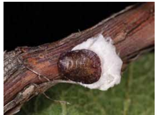
Figure 3. A soft scale female with white egg sac, potential vector of GLRaVs, collected in a vineyard near Seneca lake in the Finger Lakes Region in New York.

In nurseries and mother blocks, the use of virus-tested material followed by regular and routine monitoring for the disease, its causal agents, and insect vectors is paramount for providing planting material of high phytosanitary standards. Stocks in nurseries and mother blocks should be tested regularly for GLRaVs and such blocks isolated from commercial vineyards to avoid infection through vector transmission. Also, mealybugs and soft scales should be intensively surveyed and managed.