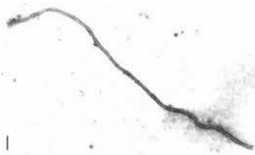
Figure 2. Electron micrograph of a GLRaV particle isolated from a leafroll-diseased vine. Note scale bar for particle size (1 nanometer - nm - equals 1/1,000,000 millimeter).

Most of these viruses can be detected by wood or green grafting onto indicator vines of V. vinifera cv. Pinot noir, Cabernet franc or Gamay. Lab tests including serological assays, such as double antibody sandwich