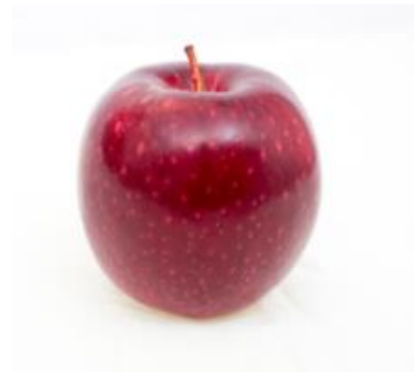
Figure 8. WA 38 (Cosmic Crisp™)

Stem length varies. Most notably some fruit have extremely short stems ending well below the shoulder of the fruit. This can lead to fruit being 'pushed' off pre harvest, causing pre harvest drop.