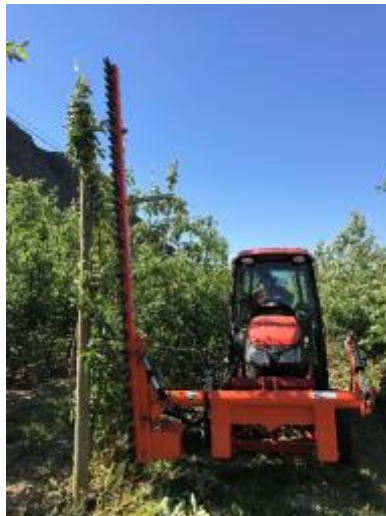
Mechanical Hedging with LeGasse Hedger, LeGasse Works, Lyons, New York.