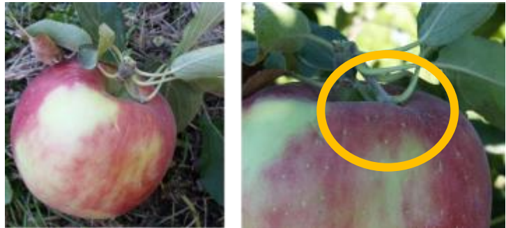
Figure 12. Spurs attached to picked fruit may pierce the skin during harvest.