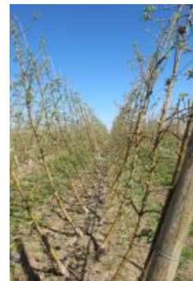
Figure 4. WA 38 in a European V system at WSU's ROZA orchard in Prosser.