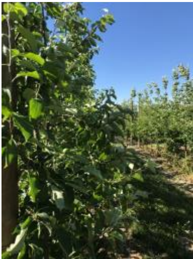
Figure 7. Before mechanical hedging.

We continue to analyze cropload and fruit quality in trees mechanically pruned and pruned by hand.