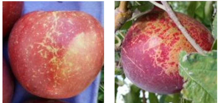
Figure 9. Mildew (left) and limb rub (right) on WA 38 apples in September 2016.