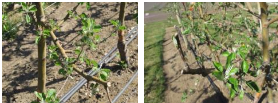
Figure 5. WA 38 branch that has been tipped. Note nice buds and branching throughout limb.

Tipping the branches of one-year-old wood helps to minimize blind wood which WA 38 is prone to. Tip the end of one-year-old wood and come back the following year to tip again leaving two to three buds.