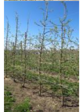
Figure 3. Mechanically pruned (top) and limb bending (bottom) spindle of WA 38.