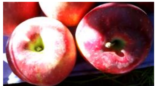
Figure 10. Stem length variations observed in WA 38.