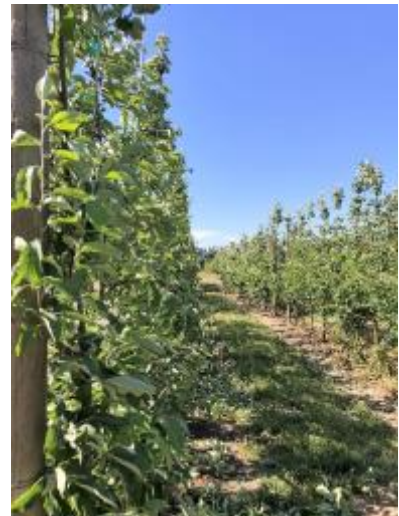
After mechanical hedging.