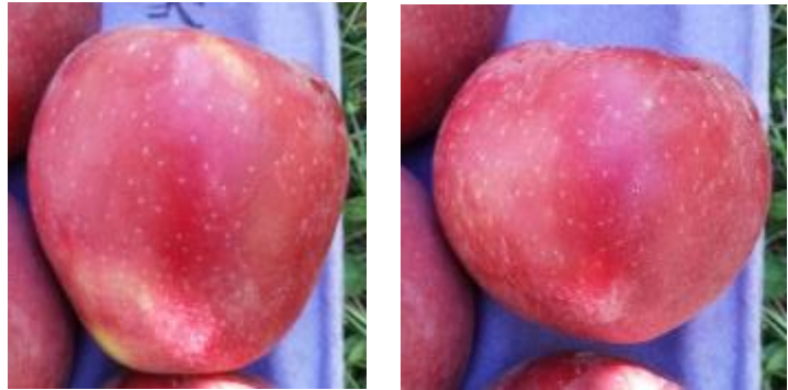
Figure 11. Fruit shape variations observed in young trees in 2016.

Other harvest observations. Stem bowl splits are observed frequently at low levels (below 5%) but can rise dramatically if fruit is harvested too late. Fruit can be damaged by piercing of skin by fruiting spurs at harvest. Occasionally spurs do not detach when fruit is being picked. WA 38 has a long harvest window since maturity is slow to change. It can be picked in a strip pick some years depending on the tree training system.