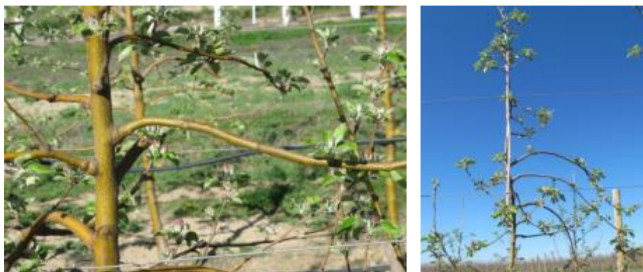
Figure 6. Large area of blind wood without buds is typical when WA 38 branches are bent downwards.

Bending is often used to reduce the vigor of a branch in tall spindle systems. However, because WA 38 is a type 4 tree (Lespinasse classification) bending tends to create blind wood. WSU research has found that bending tends to result in 2-3 more nodes of blind wood when compared to tipping one-year-old wood. This blind wood not only reduces fruiting potential but also exposes the branch to sun and sunburn due to the fruit orientation. Bending is not recommended in WA 38.