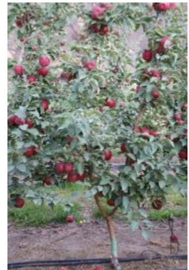
Figure 2. Bi Axis WA 38 at the WSU Sunrise Orchard in Rock Island, WA.

In both cases the two axes are grown as small independent spindle trees. Compared to a single spindle two axes tend to reduce vigor. Like the spindle system, bi-axis systems generally have high early yield and uniform light exposure. This system doubles the axes / fruiting units without doubling the tree cost.