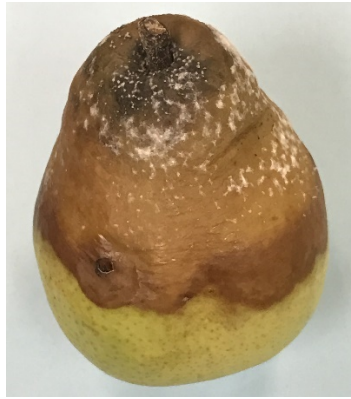
B: The color of decayed area varies with age. Water soaked at the margin. Black pycnidia at aged area near stem.