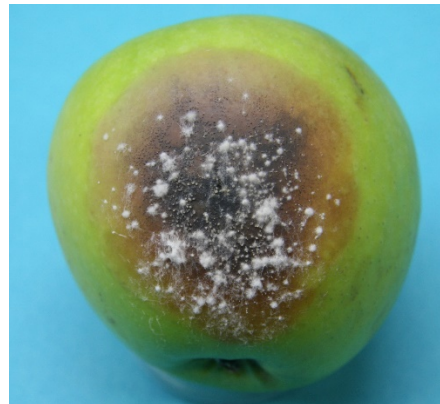
E: Early speck rot infection developing on Granny Smith under high humidity.