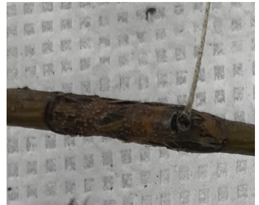
F: Twig showing dieback symptoms and pycnidia caused by P. washingtonensis .