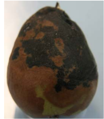
C: Advanced stage of P. pyri infection showing black coloration of the decayed area.