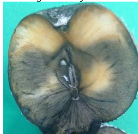
H: Cross section of a speck rot lesion showing black coloration of the internal flesh of Granny Smith apple.