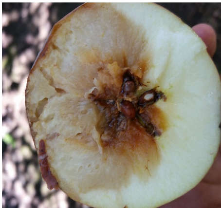
G: Internal view of a rare speck rot infection on Fuji in an orchard in the Pacific Northwest after heavy rain.