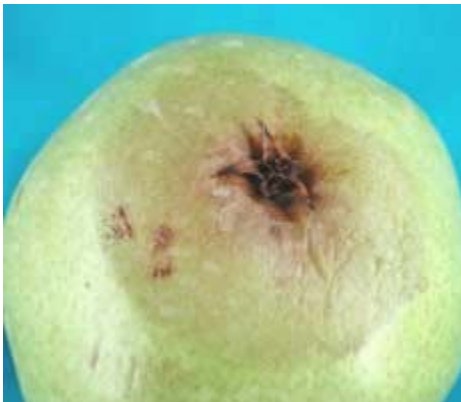
D: Early stage of calyx-end Phacidiopycnis rot. Water-soaked appearance.