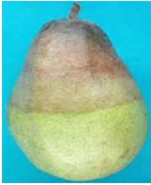
A: Early stage of stem-end Phacidiopycnis rot on a d 'Anjou fruit. Water-soaked appearance.