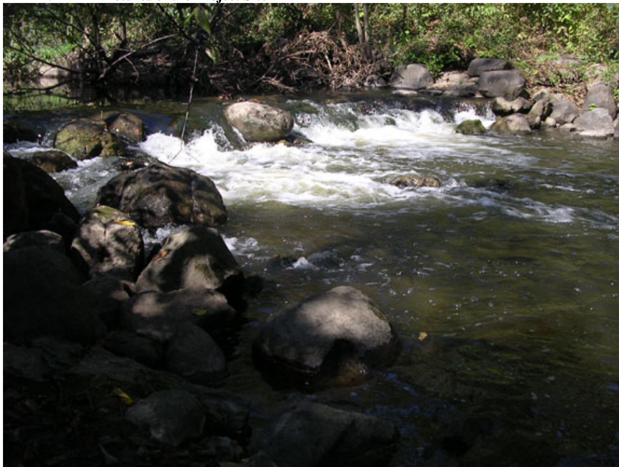
Figure 1. Photograph of the Davoust Dam (Barrier F3).