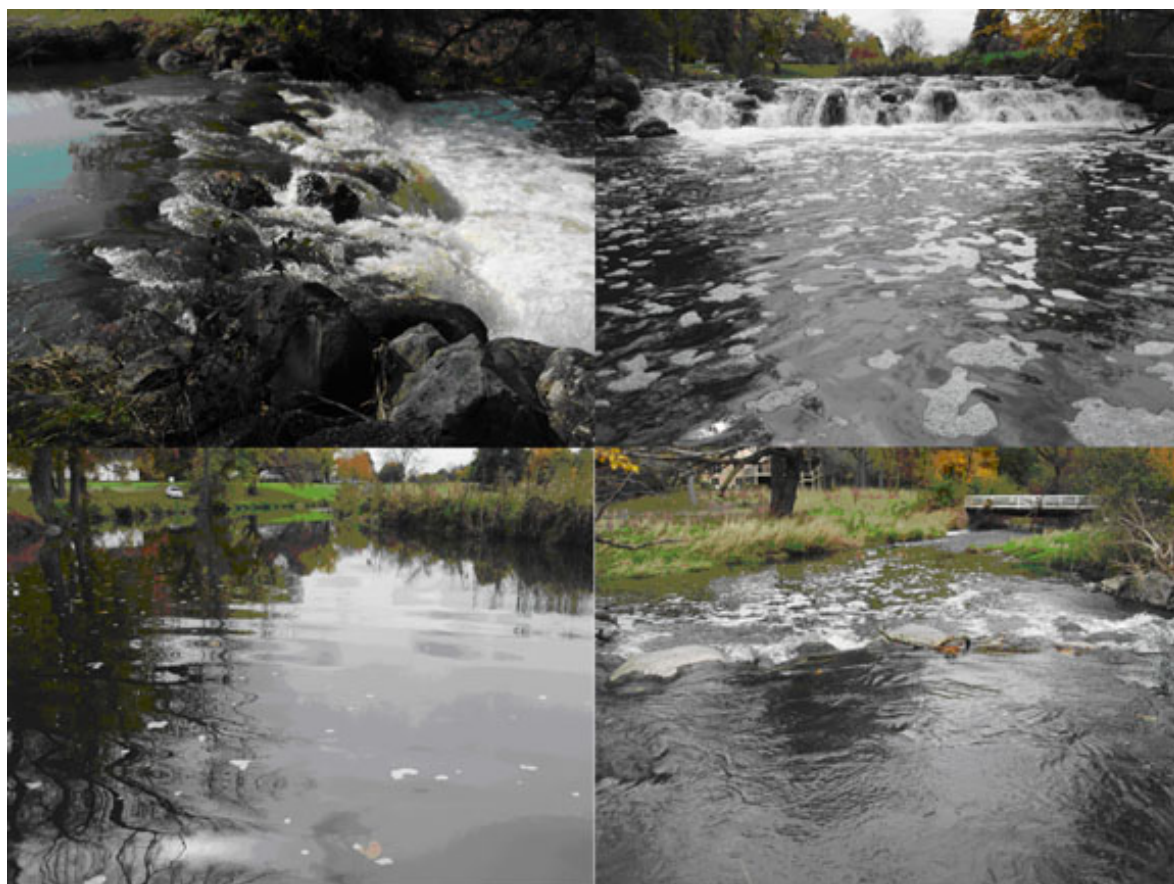
Figure 2. Photographs of the Creek Bend Forest Preserve Dam (Barrier F5) showing a view looking (clockwise from top left) across the dam, upstream at the dam, upstream above the dam, and downstream from above the dam.