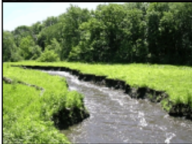
June 2004 (8 weeks after spring burn)