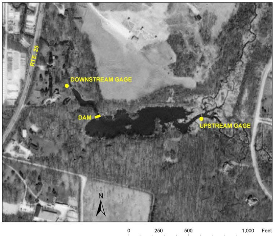
Figure 1. Location of two USGS gaging stations near the dam on Brewster Creek near St. Charles, Illinois.