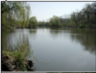
Brewster Creek/ Willow Lake, pre-dam removal