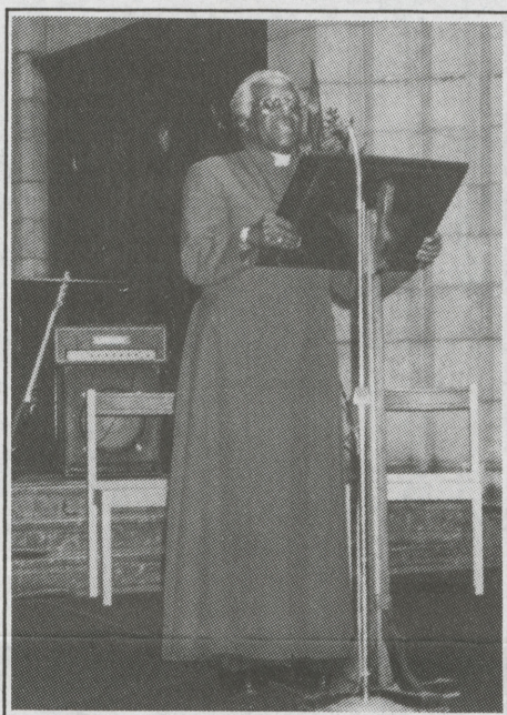
Bishop Tutu addresses the AIDS Candlelight Memorial and Mobilization in Cape Town, South Africa

Romania's first and only gay and lesbian