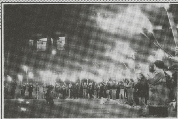
Participants in the Wellington, New Zealand AIDS Candlelight Memorial and Mobilization carry 176 torches, commemorating the 176 New Zealanders who had died of AIDS

Aides to senators Dianne Feinstein and Barbara Boxer confirmed that hundreds of these cards flooded their offices during the holiday season. Now that both women have been elected, MAA seeks to ensure that they keep AIDS issues at the tops of their agendas. ♦