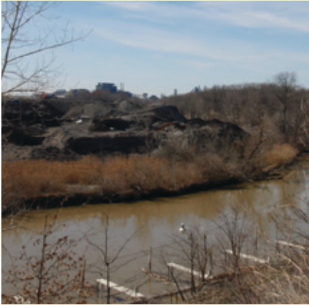
Steel waste towers 50 to 70 feet above the banks of the Black River near Lake Erie before the cleanup.