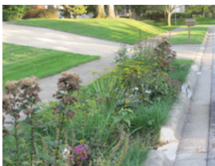
An example of a rain garden that will be planted on two streets in a Cleveland suburb.

pavement, all of which hurts water quality in the creek. And the intense volume of the storm water that follows heavy rains scours the banks of the creek, harming habitat and exacerbating erosion downstream. Solving the problem requires the participation of individual residents who live in the city.