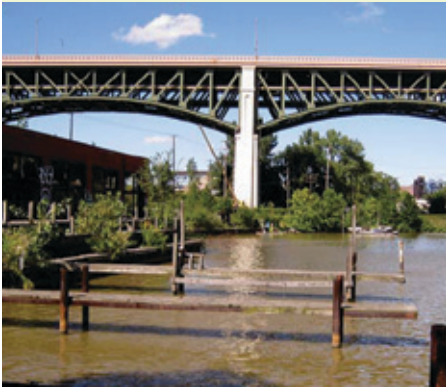
The site of an abandoned marina will become lake marsh habitat for fish.