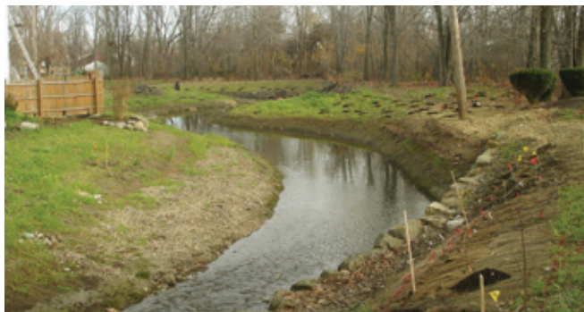
The same section of the creek after the restoration work was completed.

Environmental engineers, hydrologists, ecologists, biologists, excavators, landscape architects and landscapers.