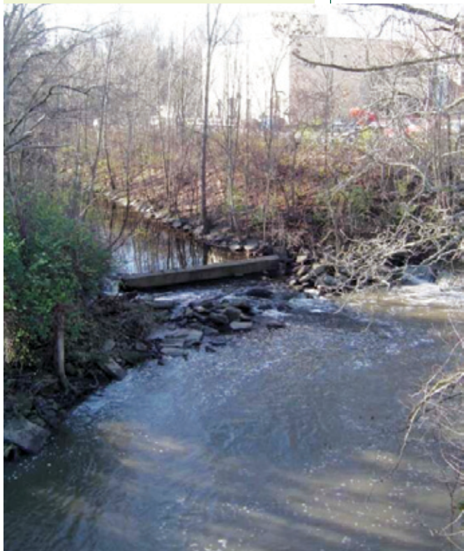
One of the three dams on Baldwin Creek that will be removed.