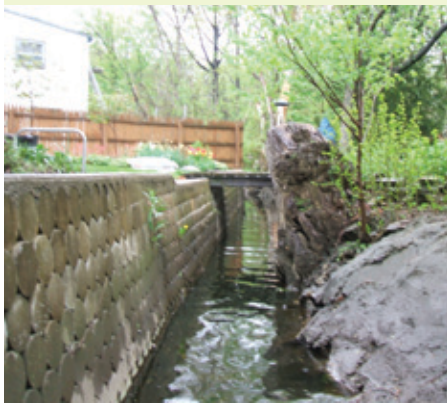
A section of Big Creek before the restoration project began.