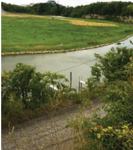
The 1.5-mile stretch of the river was restored to a natural state.

towered 80 feet above a portion of the river and leached metals into the water. Invasive species had taken hold. Habitat for birds, fish and other aquatic organisms had long since been severely impacted.