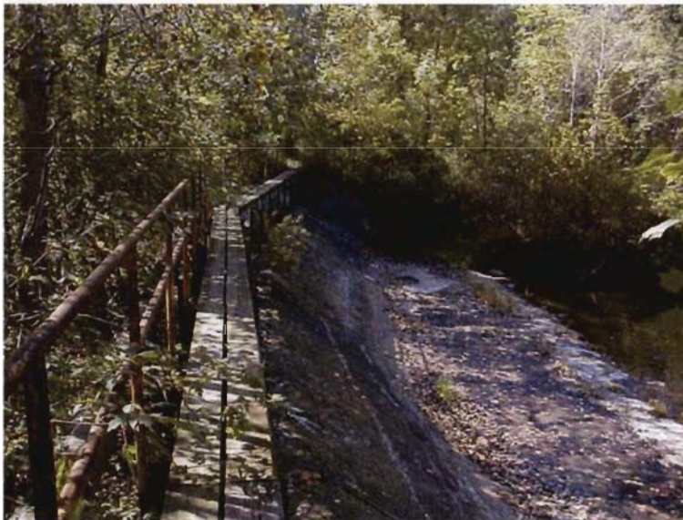
FIGURE A. Watervliet Dam looking West and East along structure