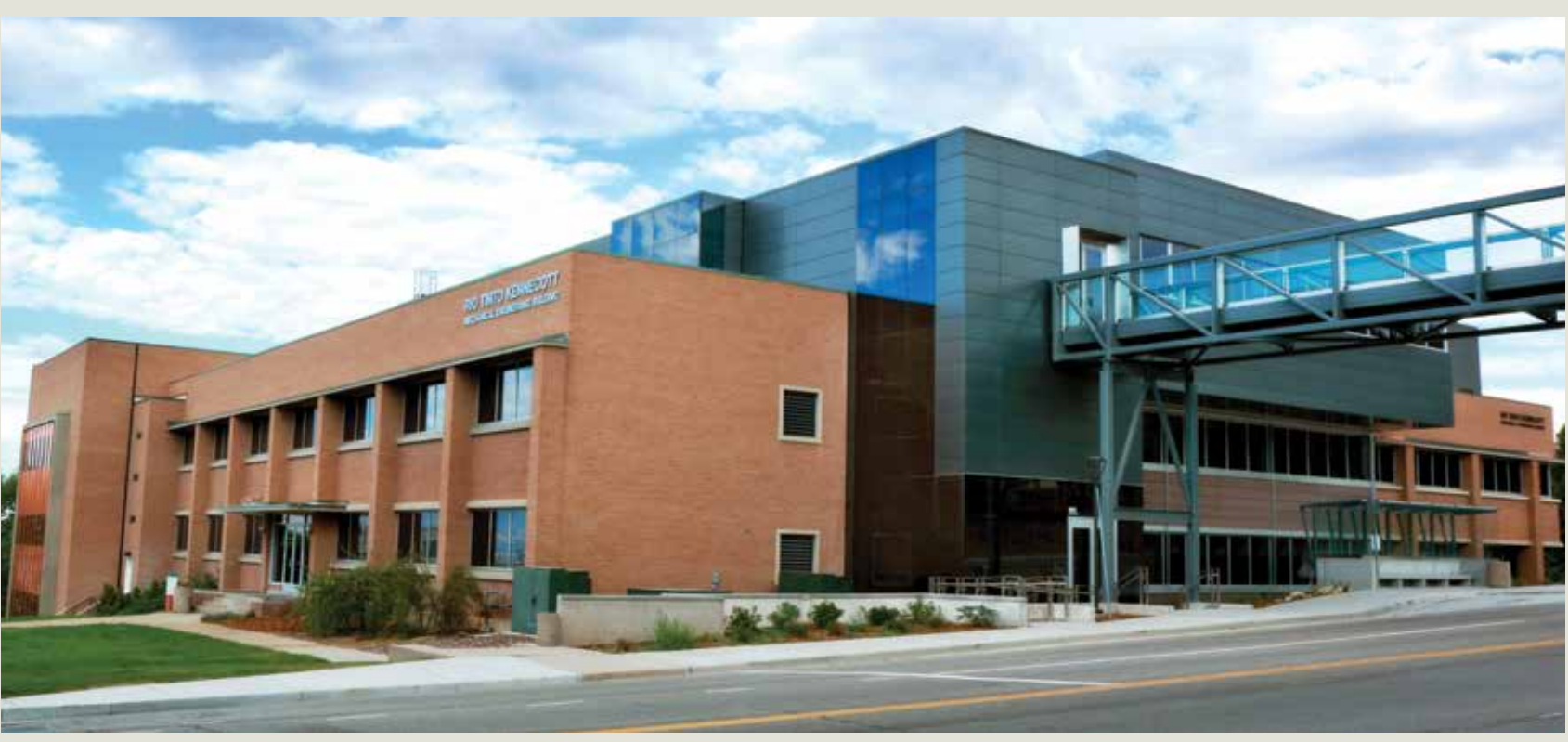
Job's Crossing spans North Campus Drive near the intersection at 100 South.