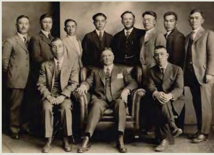
Union Pacific Roadmaster (in leather chair) with his section foremen gathered together in Salt Lake City for an annual meeting in 1934.