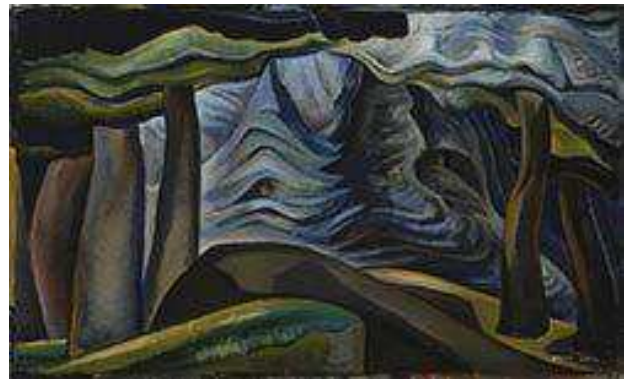
Emily Carr Deep Forest, circa 1931 oil on canvas