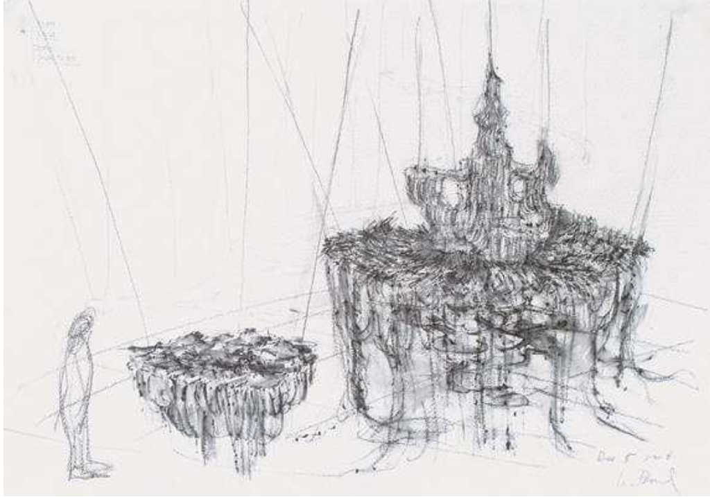
Lee Bul, Drawing, 2006