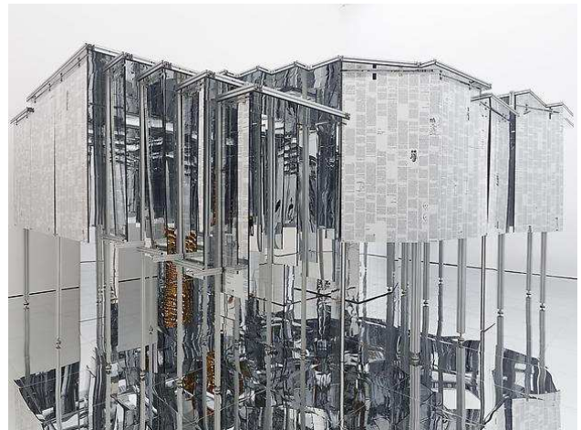
Lee Bul Via Negativa II, 2014 polycarbonate sheet, aluminum frame, acrylic and polycarbonate mirrors, steel, stainless steel, mirror, two-way mirror, LED lighting, silkscreen ink