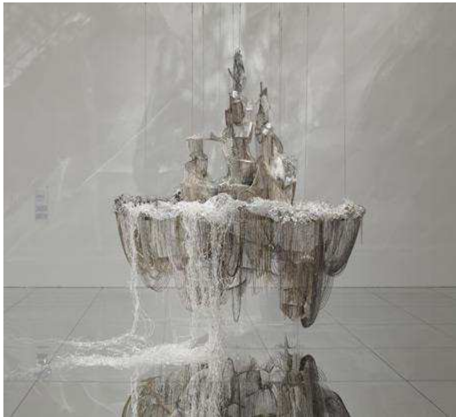
Lee Bul, After Bruno Taut (Negative Capability) , 2008