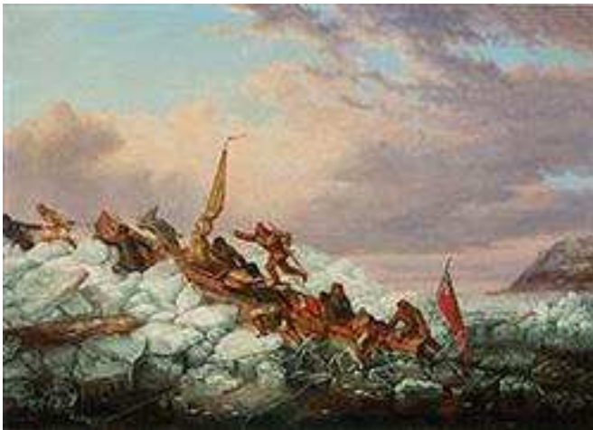
Cornelius Krieghoff The Royal Mail Crossing the St. Lawrence, 1860 oil on canvas Private Collection