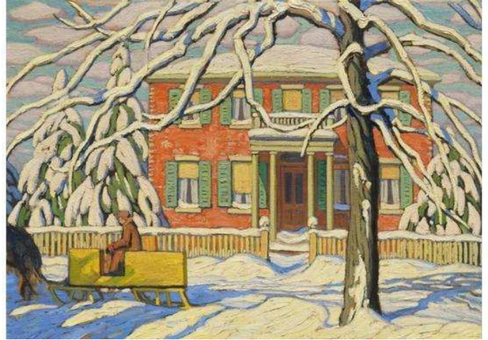
Lawren Harris, Red House and Yellow Sleigh , c. 1920