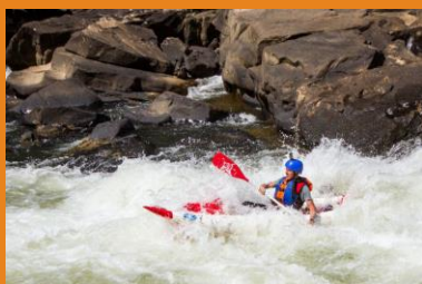
The Gauley River features guaranteed big water when the water level in the lake is drawn down.