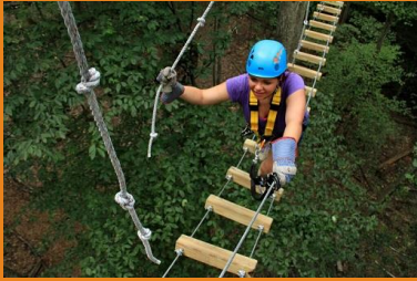
AOTG offers a variety of fun activities.

The U.S. Army Corps of Engineers opens the flood gates at West Virginia's Summersville Dam Fridays through Mondays on seven weekends in September and October, and the result is the biggest water in the world with 97 rapids Class III and above, including nine Class V.