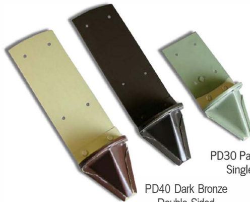
PD30 Patina Green Single Sided