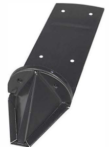
PD40 Charcoal Gray