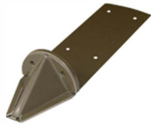
PD40 Medium Bronze