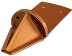
PD30 Classic Copper