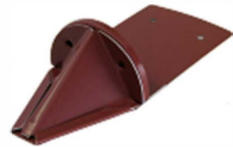
PD30 Colonial Red