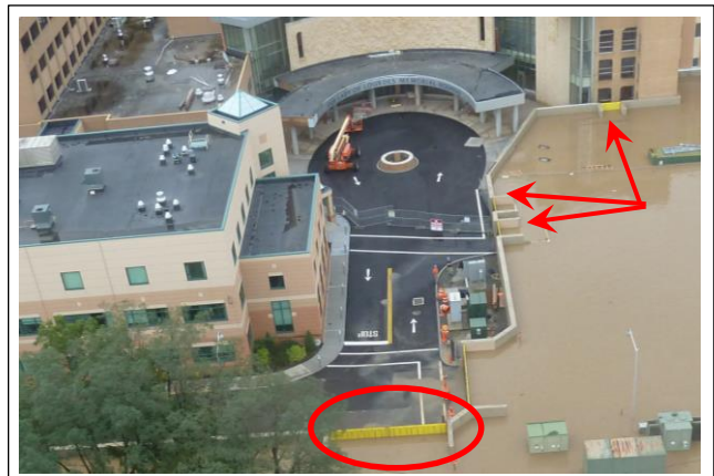
The hospital complex, September 2011. The yellow parts of the wall are the floodgates.

Mitigation: Mitigation measures included a $7 million 1,365-foot-long floodwall built to the 500-year flood elevation, and stop logs at indoor locations in case the floodwall fails or is overtopped. The floodwall has six openings that automatically close with floodgates that rise when flooded. They do not require human intervention or power and remain hidden beneath the entryways, allowing unimpeded access.