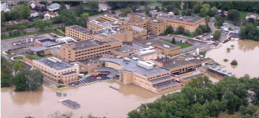
Our Lady of Lourdes Hospital, September 2011