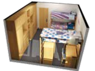
Image of sample triple on-campus room