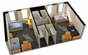
Image of sample double on-campus room