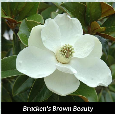
Bracken's Brown Beauty