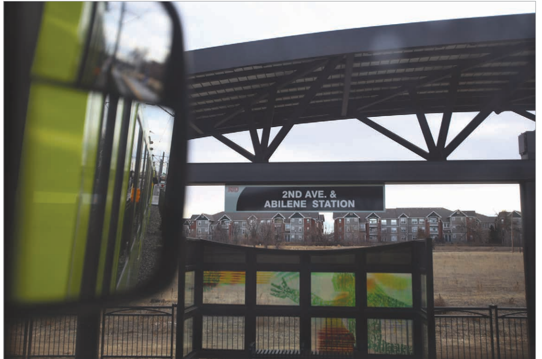
The R Line stops Feb. 17 at the 2nd Avenue and Abilene Station in Aurora. After just a few months delay — the line was originally slated to open in late 2016 — the Regional Transportation District's Aurora-bound train is passenger ready and will welcome riders Feb. 24.

Follow @EditorDavePerry on Twitter and Facebook or reach him at 303-750-7555 or dperry@AuroraSentinel.com