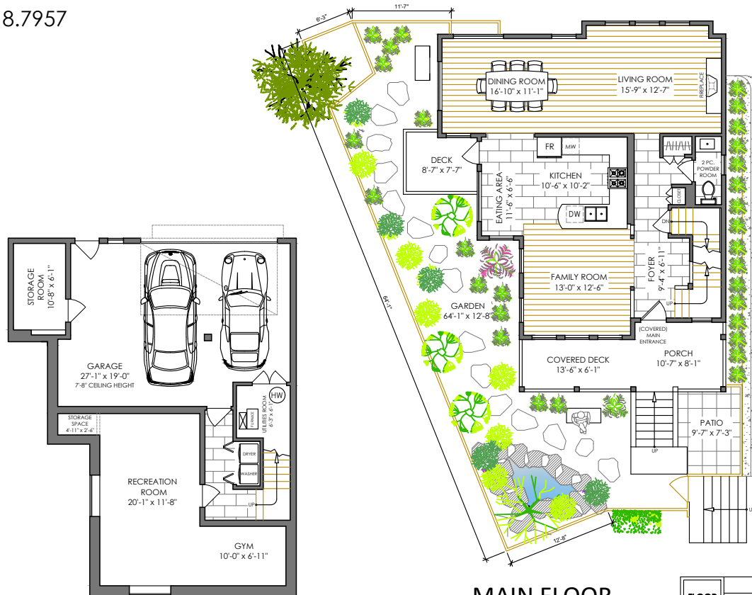
LOWER FLOOR 572 SQ.FT 7'-6" CEILING HEIGHT