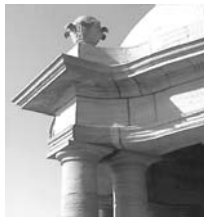
Jahangir Kothari Parade

Otherwise, the dome was not important in ancient Greek architecture. The Romans developed the masonry dome in its purest form, culminating in a temple built by the emperor Hadrian. Set on a massive circular drum the coffered dome forms a perfect hemisphere on the interior, with a large oculus (eye) in its center to admit light.