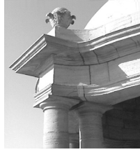
Jahangir Kothari Parade

Origins: The dome seems to have developed as roofing for circular mud-brick huts in ancient Mesopotamia about 6000 years ago. In the 14th century B.C. the Mycenaean Greeks built tombs roofed with steep corbeled domes in the shape of pointed beehives (tholos tombs). Otherwise, the dome was not important in ancient Greek architecture. The Romans developed the masonry dome in its purest form, culminating in a temple built by the emperor Hadrian. Set on a massive circular drum the coffered dome forms a perfect hemisphere on the interior, with a large oculus (eye) in its center to admit light.