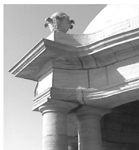
Jahangir Kothari Parade

Origins: The dome seems to have developed as roofing for circular mud-brick huts in ancient Mesopotamia about 6000 years ago. In the 14th century B.C. the Mycenaean Greeks built tombs roofed with steep corbeled domes in the shape of pointed beehives (tholos tombs). Otherwise, the dome was not important in ancient Greek architecture. The Romans developed the masonry dome in its purest form, culminating in a temple built by the emperor Hadrian. Set on a massive circular drum the coffered dome forms a perfect hemisphere on the interior, with a large oculus (eye) in its center to admit light.