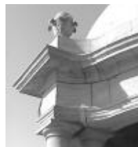
Jahangir Kothari Parade

Origins: The dome seems to have developed as roofing for circular mud-brick huts in ancient Mesopotamia about 6000 years ago. In the 14th century B.C. the Mycenaean Greeks built tombs roofed with steep corbeled domes in the shape of pointed beehives (tholos tombs). Otherwise, the dome was not important in ancient Greek architecture. The Romans developed the masonry dome in its purest form, culminating in a temple built by the emperor Hadrian. Set on a massive circular drum the coffered dome forms a perfect hemisphere on the interior, with a large oculus (eye) in its center to admit light.