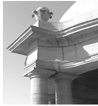
Jahangir Kothari Parade

Origins: The dome seems to have developed as roofing for circular mud-brick huts in ancient Mesopotamia about 6000 years ago. In the 14th century B.C. the Mycenaean Greeks built tombs roofed with steep corbeled domes in the shape of pointed beehives (tholos tombs). Otherwise, the dome was not important in ancient Greek architecture. The Romans developed the masonry dome in its purest form, culminating in a temple built by the emperor Hadrian. Set on a massive circular drum the coffered dome forms a perfect hemisphere on the interior, with a large oculus (eye) in its center to admit light.