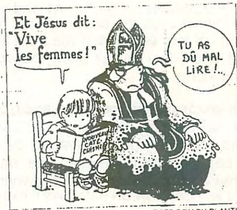
'And Jesus said: "Long live women!"' 'You must have misread it! ...'