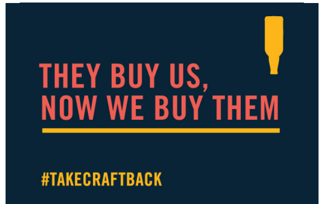
Take Craft Back Campaign Image