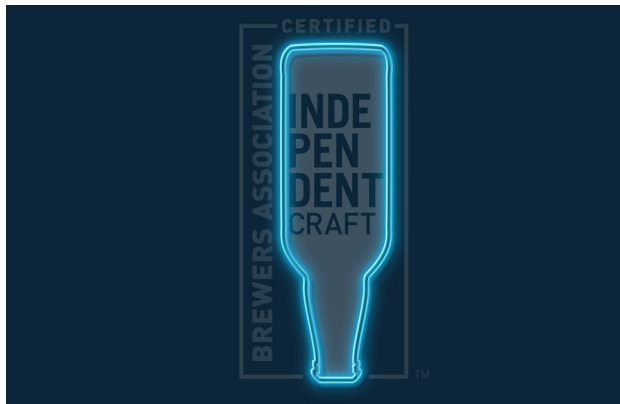
Take Craft Back Campaign Gif

Here are some images you can use in your own posts. Feel free to use these or get creative with your own visuals. Download the zipped file here.