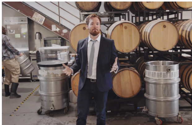
Anthem Video Image