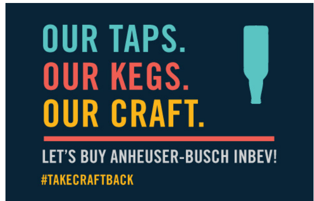
Take Craft Back Campaign Image