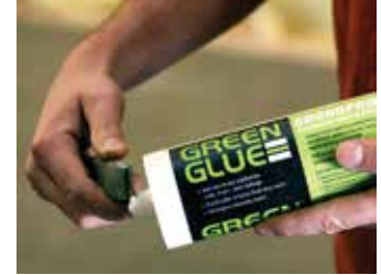
Step 2: Cut the end of the tube

Scan QR code to see how to apply Green Glue Noiseproofing Compound.