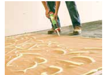
Step 3: Apply in large beads

Cut the end of the tube as shown in top right image. Screw on separate nozzle and cut end leaving an opening of 3/8" or more.