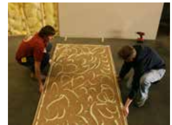
Step 4: Raise the board

Apply Green Glue to the second sheet of drywall on a clean, flat surface. Apply the glue in beads in a random pattern across the entire board. Leave a 2-3" border with no Green Glue around the edge of the board. This will allow for better handling of the board. Use 2 tubes per 4'x8' sheet.