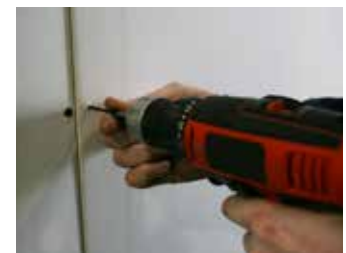
Step 4: Fasten in place

After applying Green Glue to the back of the second layer, raise the board into position, press the board against the wall or ceiling, and fasten in place using appropriate screws. The Green Glue will squeeze into a thin layer (about 0.5 mm). The second layer must be hung and screwed within 15 minutes to prevent Green Glue from drying before it is in place. Typical screw spacing is 16" oc for walls and 12" oc for ceilings, but be sure to follow all appropriate local building codes regarding screw type and spacing. Use our Green Glue Noiseproofing Sealant to seal the perimeter and around electrical outlets, paying special attention to the crack where the drywall meets the floor as this doesn't get taped and mudded.