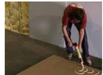
Step 3: Apply Green Glue

Hang the first layer of drywall. After hanging the first layer of drywall, it is recommended that you seal the seams between sheets. This can be done with drywall mud. Using acoustical sealant, take care not to use a bead so large that it protrudes outside the plane of the drywall, preventing the second layer from sitting flat. If speed is an issue, you can omit this step by staggering the seams between the first and second layers of drywall. Seal the perimeter after the last sheet of drywall is installed.