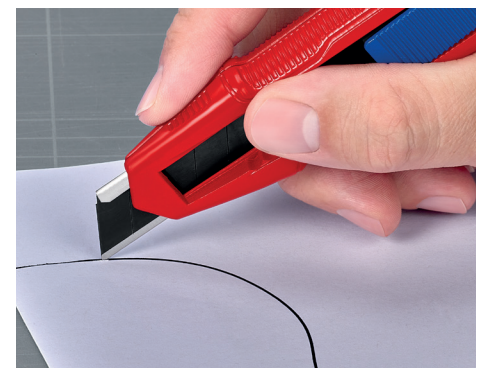
Multiple non-slip gripping zones for precise work.