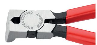
72 21 160 \sphericalangle 85^\circ