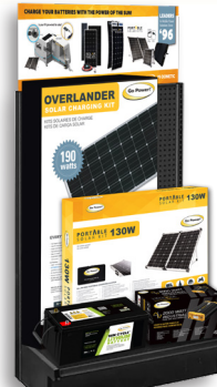
4ft Solar Display