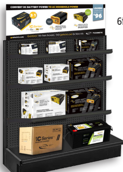
6ft Inverter Display