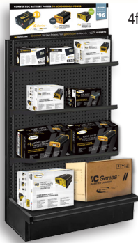
4ft Inverter Display