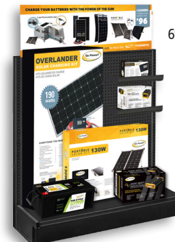
6ft Solar Display

ORDER SHEET AT BACK. DISPLAY ITEMS AVAILABLE WITH PURCHASE.