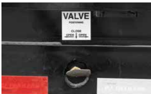
HYDRAULIC PROPORTIONING VALVE