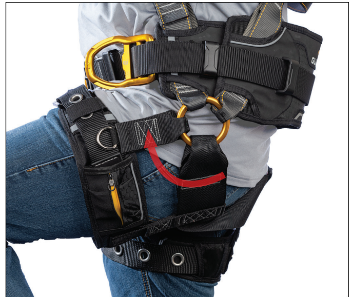
Full range of unrestricted movement