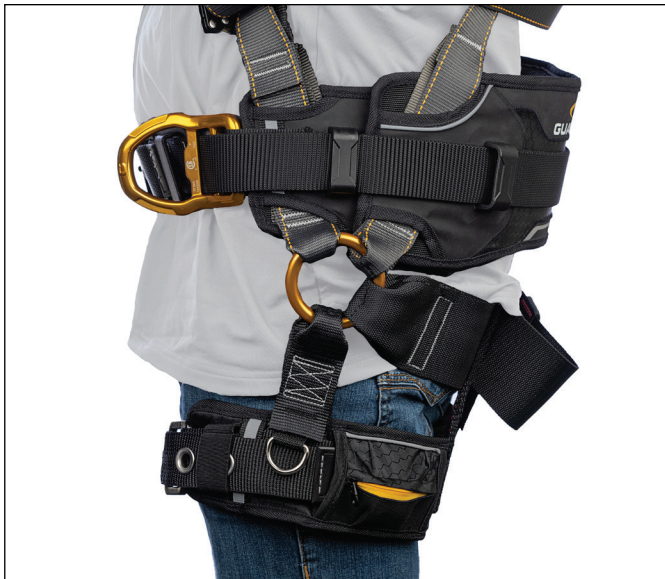
Unique O-Ring chassis design

The B7-Comfort's unique Three-Six-O harness chassis design keeps the harness fully integrated while allowing the torso and sub-pelvic & legs to move independent of each other. This lends to a full range of unrestricted movement of the hip joint for unrivaled mobility around the job site.