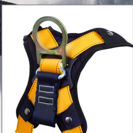
Shoulder Padding (Optional)

Designed, Tested, and Assembled in the United Kingdom