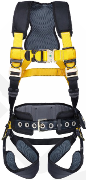
Pictured: 37376 Represents 37377 - 37379