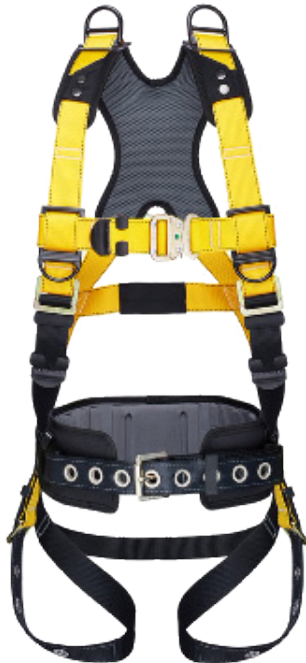
Pictured: 37216 Represents 37217 - 37219, 372171