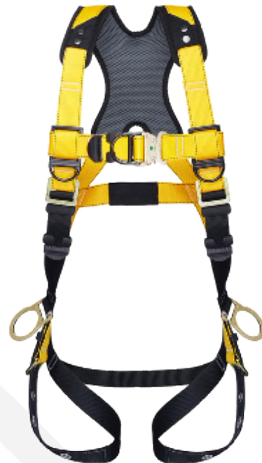
Pictured: 37132 Represents 37133 - 37135