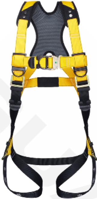
Pictured: 37128 Represents 37129 - 37131