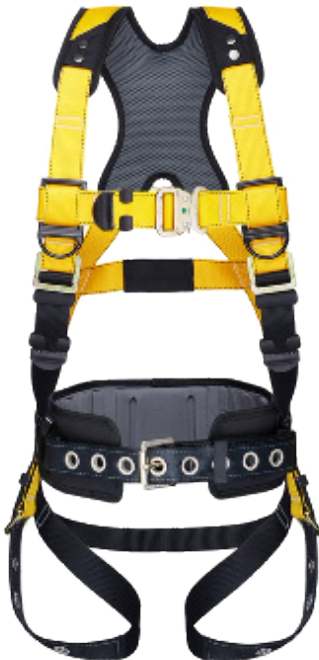
Pictured: 37200 Represents 37201 - 37203, 372001 - 372008, 372011 - 372019, 372021 - 372028, 372031 - 372037, 3720111 - 3720112