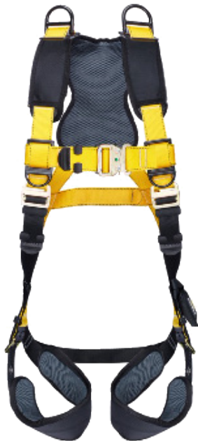
Pictured: 37320 Represents 37321 - 37323