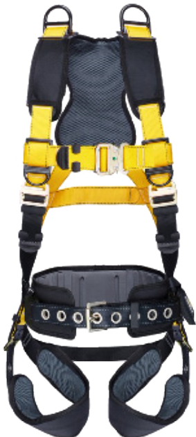
Pictured: 37384 Represents 37385 - 37387