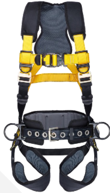
Pictured: 37380 Represents 37381 - 37383, 373801, 373811, 373821, 373831