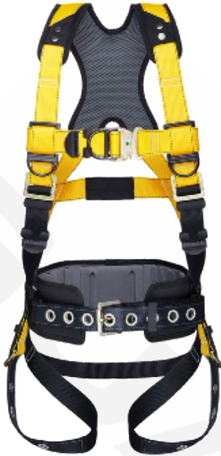
Pictured: 37208 Represents 37209 - 37211, 372111