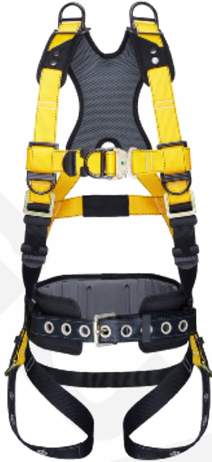
Pictured: 37224 Represents 37225 - 37227