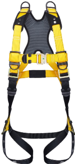
Pictured: 37136 Represents 37137 - 37139