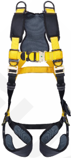
Pictured: 37328 Represents 37329 - 37331