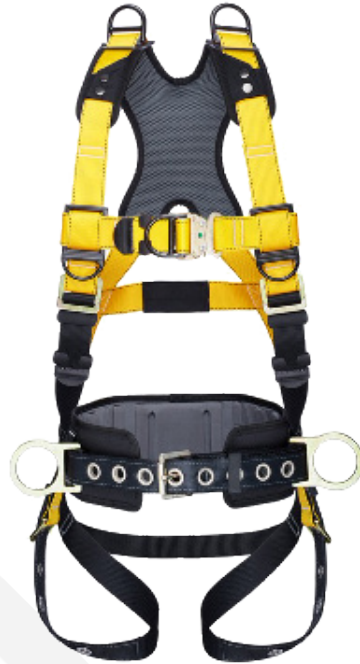
Pictured: 37300 Represents 37301 - 37303, 373001 - 373005 373011 - 373016, 373021 - 373025, 373031 - 373035