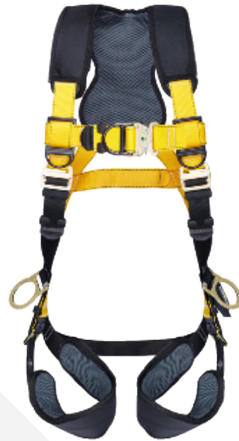
Pictured: 37316 Represents 37317 - 37319