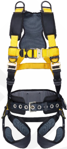
Pictured: 37392 Represents 37393 - 37395