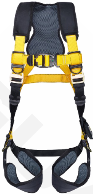
Pictured: 37312 Represents 37313 - 37315