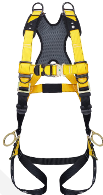
Pictured: 37196 Represents 37197 - 37199 371961, 371971, 371981, 371991