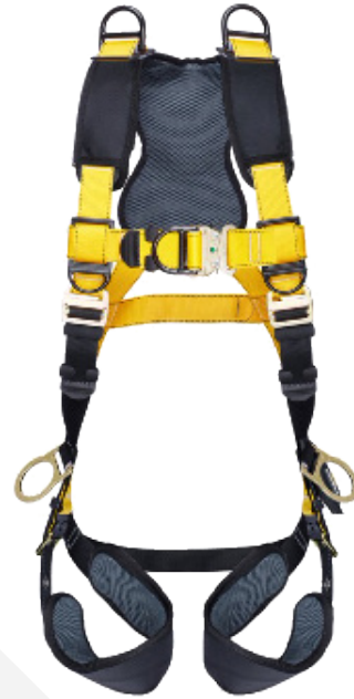
Pictured: 37364 Represents 37365 - 37367 373651, 373661, 373671