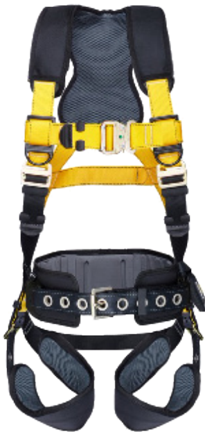
Pictured: 37368 Represents 37369 - 37371, 373681 - 373687, 373691, 3736910, 3736911, 373692 - 373699, 373701 - 373707, 373711 - 373715