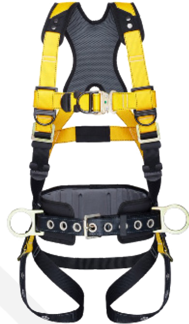
Pictured: 37212 Represents 37213 - 37215