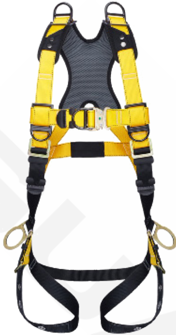
Pictured: 37144 Represents 37145 - 37147