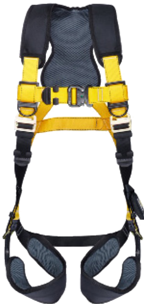
Pictured: 37304 Represents 37305 - 37307, 373041, 373042, 373051, 373052, 373061, 373062, 373071