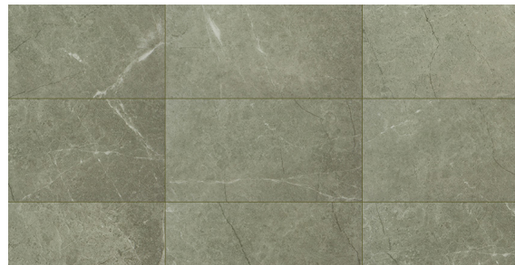
Cinder (Shown Above)