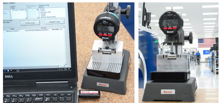
Rocker shaft measurement data from fixtured digital indicator stand is transmitted to laptop (left) or to inspector 200' across the plant (right).

Data integrity is a vital part of accuracy in precision manufacturing, especially so today. If the measurement data taken from precision gages is recorded, transmitted or logged incorrectly, several problems could occur. Parts can be scrapped, product performance could suffer, expensive production labor and machine time can be lost and excessive time will be spent logging data manually, which also increases the potential for error. In addition, none of the data can be officially documented or verified for SPC and traceable for customer requirements without a reliable automated system – one that can capture the measurement data to meet Industry 4.0 level manufacturing and make it available for integration with other data in the plant.