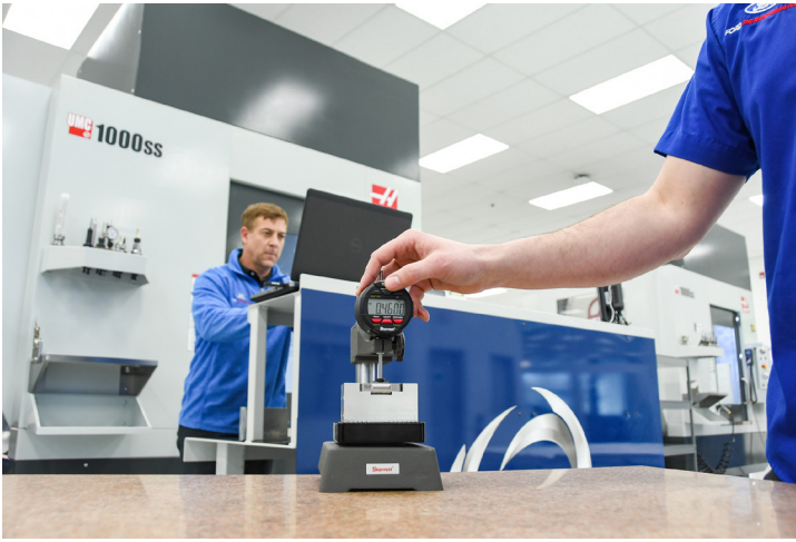
Measurement data being transmitted to laptop user at machine.

New Data Collection Technology Ensures Speed, Accuracy, Scalability and Security.