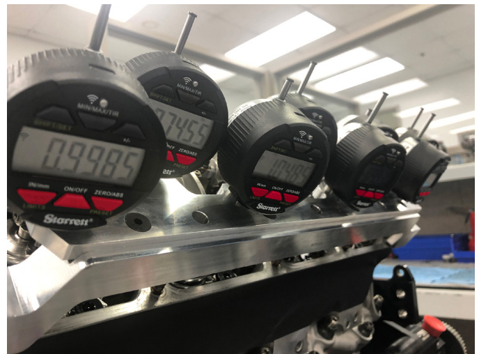
Multiple Starrett Digital Indicators in engine-mounted fixture capture and transmit T.I.R. measurement data to computer devices.