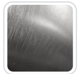
NI Nickel PVD