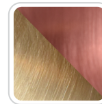
NAT Natural Brass/ Copper