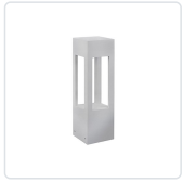
EB2924-BN Brushed Nickel

Architectural designed high powered LED exterior bollard fixture, 24" height, 6" die-cast aluminum square shaped housing with four rectangular shaped openings in powder coated black, brushed nickel or white finishes. Inside the top is our 120V AC LED technology concealed by a clear 5VA acrylic diffuser which radiates the light downward and throughout all openings and surrounding areas of the bollard. Certified ETL wet location listed and is available in two different heights.