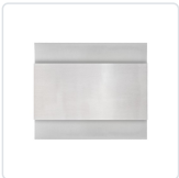
EW6108-BN Brushed Nickel