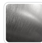
NI Nickel PVD