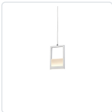
PD31405-BN Brushed Nickel