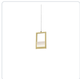
PD31405-BB Brushed Brass