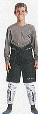
STEP 3: Bauer hockey pants, starting from $34.97.