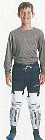
STEP 2: Bauer shin guards, starting from $24.97.