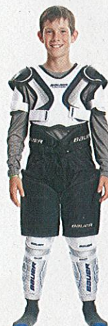
STEP 4: Bauer shoulder pads, starting from $24.97.