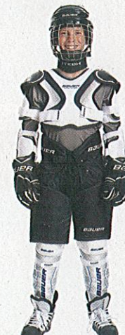
STEP 6: Bauer hockey helmet, $49.97, neck guard, $12.97, and hockey skates, starting from $34.97.