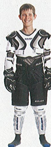
STEP 5: Bauer elbow pads, starting from $14.97, and hockey gloves, starting from $29.97.