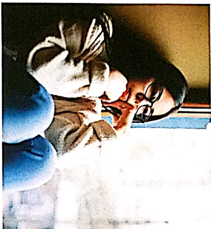
Stock Photos. Posed by Models

Abortion can be one of the most traumatic events a person can experience. The pain of abortion can be intensified by a sense of isolation and alienation from God, family and Church. The Church has always spoken out against abortion while maintaining a tradition of love, understanding and forgiveness for those hurt by abortion.