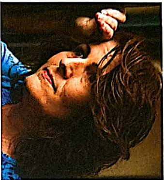
Stock Photos. Posed by Models.

"I DIDN'T THINK ANYONE WOULD UNDERSTAND HOW I FELT."