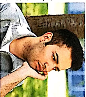
Stock Photos. Posed by Models

Before and after abortion, feelings of fear, anxiety, guilt and panic can arise—not only for the woman who undergoes the abortion, but also for the husband or boyfriend, the grandparents, siblings and friends.