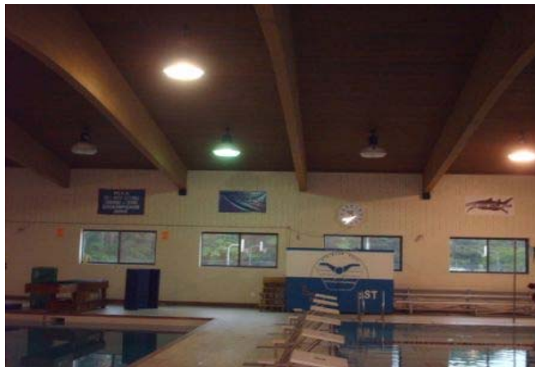
Pool decking and ceiling above the pool

Important Note: As noted previously, there is evidence to suggest that this roof may support the solar hot water panel loads. However, a structural analysis must be performed on the affected members before the project is to proceed to construction. It is recommended that this be done prior to, or as part of, the detailed design phase for this project.