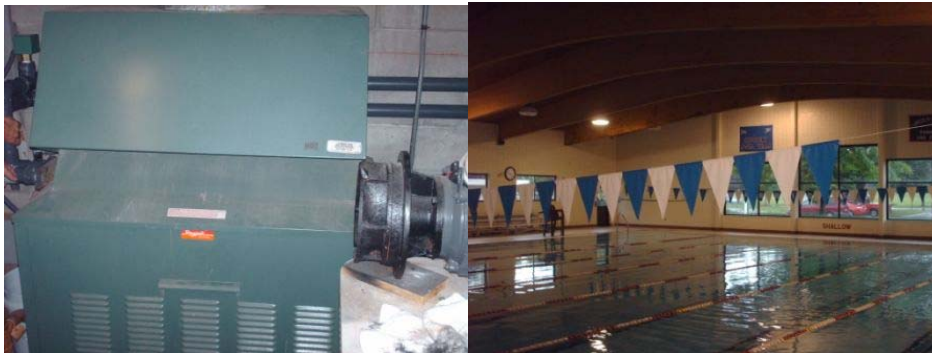
Existing pool heater and pool

Two pool heaters operate independently to maintain different temperature set points for each of the pools. The smaller pool heater, rated at 511 MBH maintains the dive pool between 84 and 85 degrees F. The lap pool is maintained between 82 and 82.5 degrees by a separate 800 MBH pool heater. Flow through the heaters is through a bypass loop off of the main filtration loop.