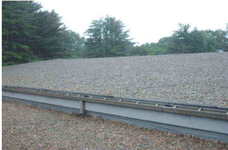
Pool roof with ballast

Although there are many trees that surround this facility, trees that are growing close to the roof are to the northeast and will only cast a shadow on a small portion of the roof for a short period of time. Furthermore, these trees and all others on the property are owned and maintained by the town. The town would be responsible for trimming nearby trees so that full solar access can be maintained.