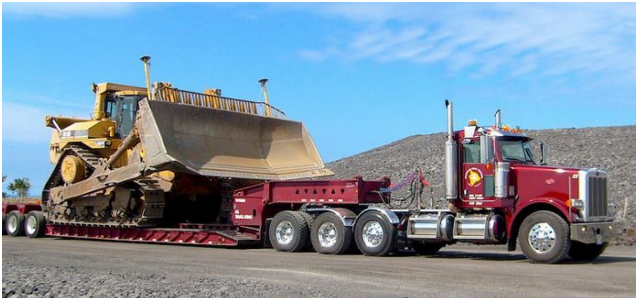
Figure 2: Typical earth-moving equipment for a project of this scale

The health and safety issues under review by the ZBA include issues related to construction. I strongly urge the board to request information from the developer regarding the earth removal issues raised herein, at this time, before any more peer review of incomplete traffic and safety data is undertaken. Since large trucks pose far more safety issues than cars, we must have a detailed understanding of the safety impact of thousands of trucks on our congested and narrow roads. Answers that do not include accurate topo sections based on stamped engineering drawings should be rejected. If the developer is unable to provide the necessary information at the proper level of detail, the process should be halted until such information can be provided.