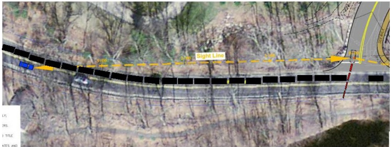
Figure 1: The yellow line is the traffic study site line assuming no cars. I have added the black cars to indicate real world conditions. The red line is the actual site line